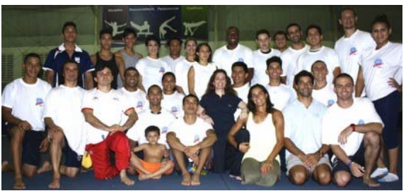
FIG Academy for Acrobatic Gymnastics Level 1 - Panama City (PAN), August 31 - September 7, 2013

The eighth Academy for Acrobatic Gymnastics was held in Panama in early September. Twenty-one coaches representing six countries – Bolivia, Brazil, Colombia, Mexico, Panama and Puerto Rico – participated in this the Academy.