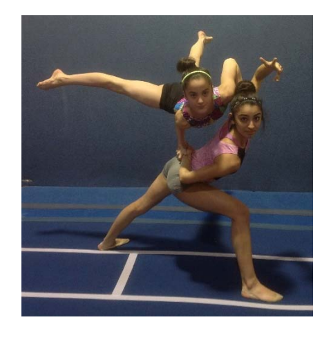
Base Position = 2vTop Position = 1v

The following element was submitted for evaluation in 2014 and the decision was not published, therefore, this element has value from IMMEDIATE EFFECT .